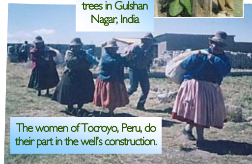
The women of Tocarayo, Peru, do their part in the well's construction.

Sustainability: Meeting present needs in a way that does not jeopardize future needs.